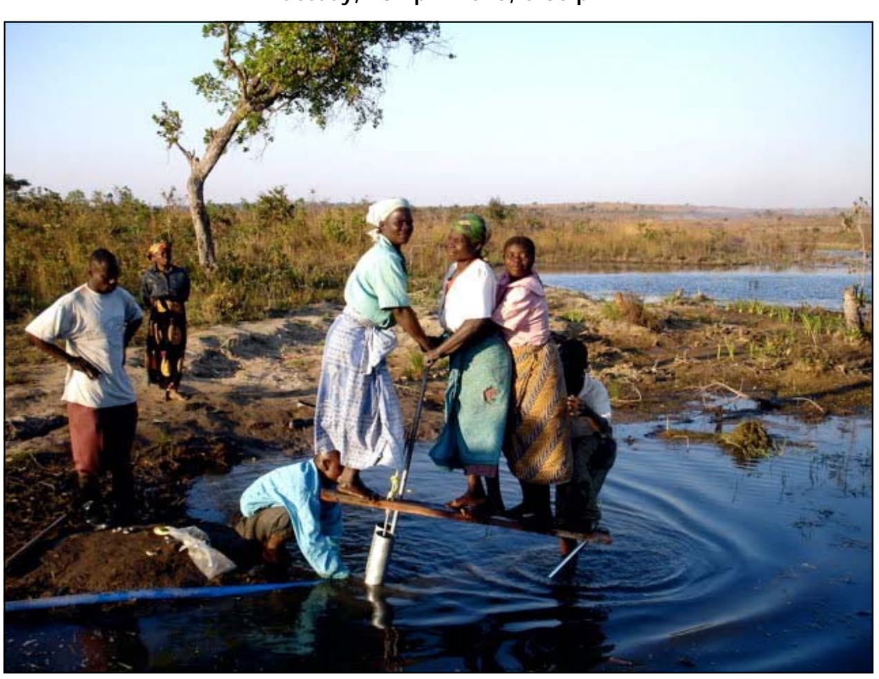
The film will be followed by a Q & A session with