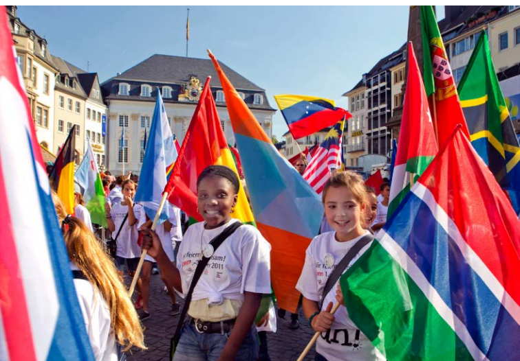
Different nations celebrate UN Day in front of the Old Town House