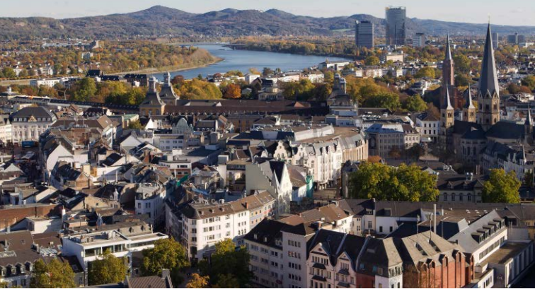
The city of Bonn