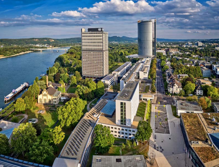
UN Campus with Post Tower