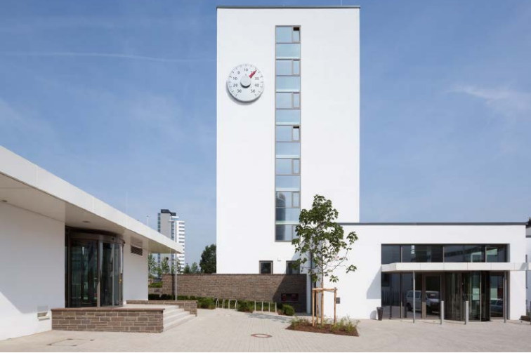
UN Campus – seat of UNFCCC

In addition to the day-to-day work of the United Nations and its partners, Bonn's role as a location for meetings and conventions also makes the city an important player on the international sustainability scene. This is where the world community gathers for conferences addressing the key challenges of the future, such as biodiversity, climate protection or renewable energy.