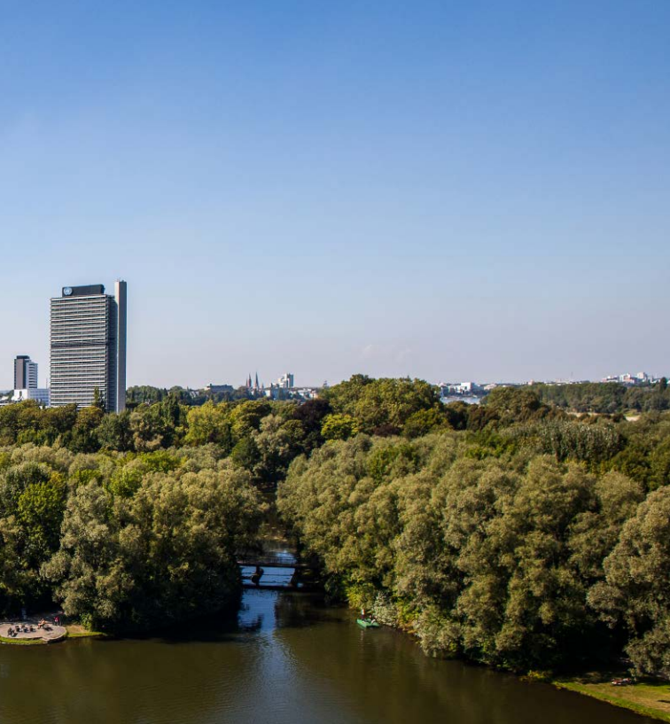
Bonn Rheinaue Park