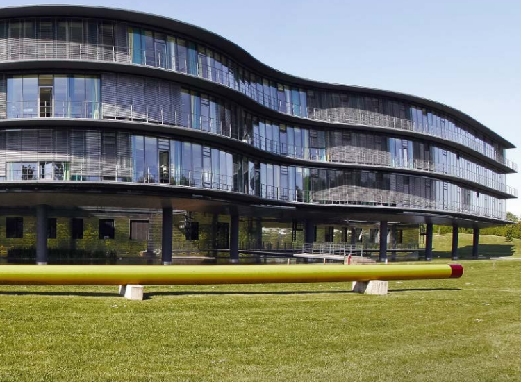
Caesar – center of advanced european studies and research in Bonn

and of the United Nations Platform for Space-based Information for Disaster Management and Emergency Response (UN-SPIDER), is also based in Bonn. Moreover, Bonn is home to 6 Fraunhofer Institutes and to the Bonn International Center for Conversion (BICC).