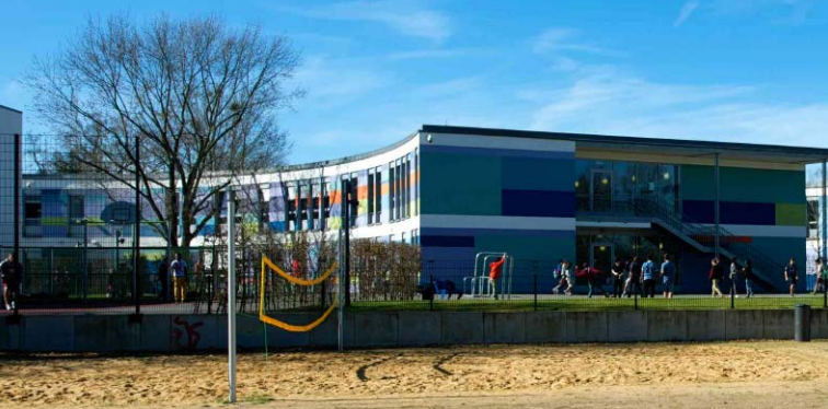
Bonn International School