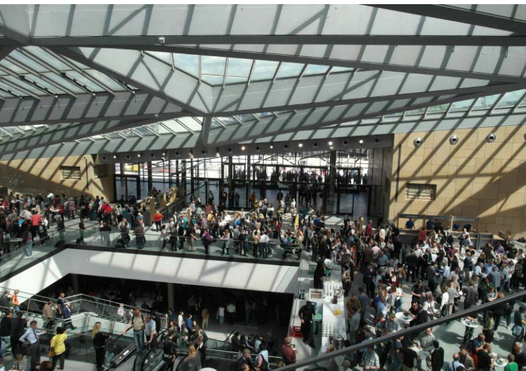
Conference venue of sustainability – the World Conference Center Bonn

And sustainability is not just the subject of conferences taking place in Bonn. The concept is also embraced by conference organizers throughout the city. Since 2006 numerous hotels, caterers and event venues have joined the network “ Sustainable Bonn – Konferenzort der Nachhaltigkeit ” and continually review the sustainability of their activities.