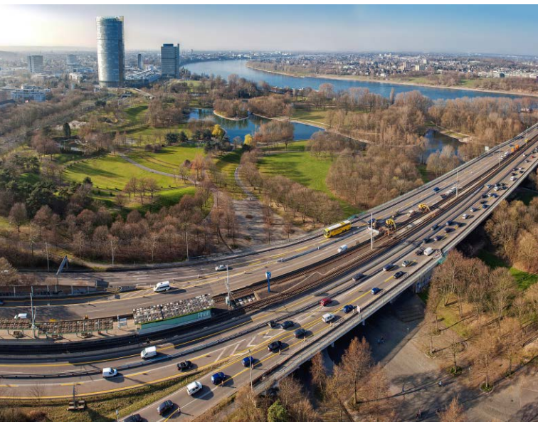
Konrad Adenauer-Brücke – one of three bridges crossing the Rhine in Bonn

In addition to the federal ministries, numerous other federal government offices – such as the Federal Agency for Nature Conservation (BfN), the Federal Office for Food and Agriculture and the Bundesrechnungshof (Federal court of Auditors) – are located in Bonn. The German Commission for UNESCO has its head office in Bonn, and Bonn is one of two seats of Deutsche Gesellschaft für Internationale Zusammenarbeit (GIZ), which provides international cooperation services for sustainable development. Moreover, the Federal City of Bonn still hosts a number of diplomatic and consular missions. Following the relocation of the German government and parliament to Berlin, Bonn has developed a unique profile