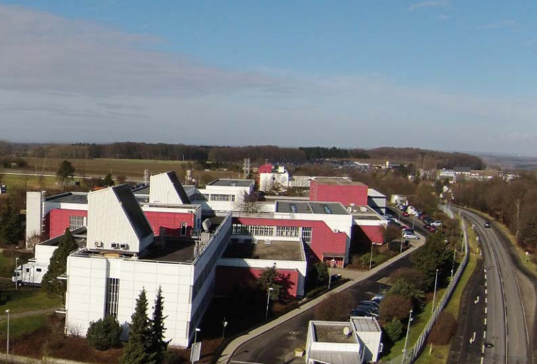
Fraunhofer Institute for high frequency physics and radar techniques FHR in Wachtberg near Bonn

by establishing and enhancing strategic partnerships between scientific and non-scientific actors and presenting them in innovative event formats.