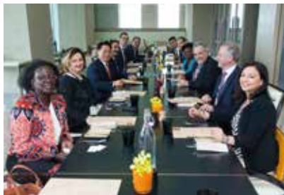
By mobilizing partners and resources to achieve larger development impact, UNIDO drives modern and green industry.

In doing so, investment promotion and the transfer of sustainable technologies have been at the forefront of these efforts. The Investment and Technology Promotion Office (ITPO) in Bonn participates in this endeavour by fostering mutually beneficial industrial cooperation between enterprises in Germany and in developing countries.