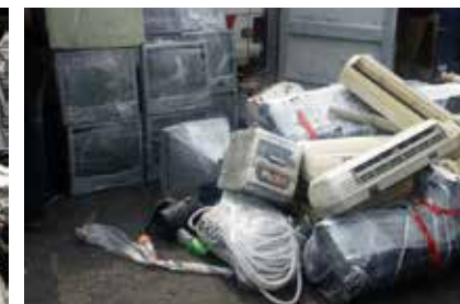
E-waste export to Africa.