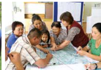
Community members identify exposure areas and critical infrastructure during a participatory mapping activity. Keminsky rayon-Boroldoi, Kyrgyzstan 2016.