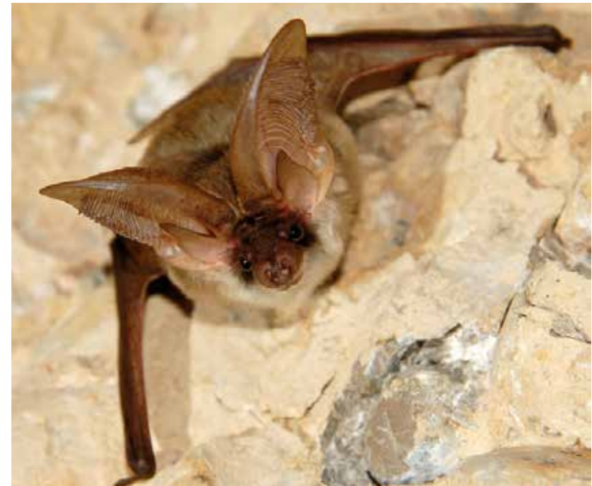
Long-eared bats live in forests and feed on moths and butterflies they collect from plant surfaces.