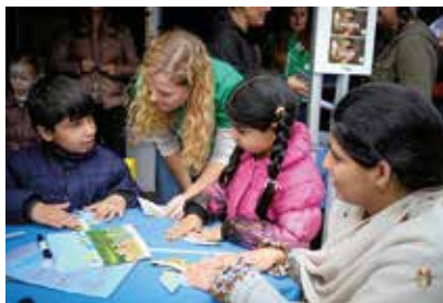
"A better future for everyone", UN Day celebrations.

"We will speak for our rights and we will bring change through our voice. We must believe in the power and the strength of our words. Our words can change the world." Malala Yousafzai, UN Messenger of Peace