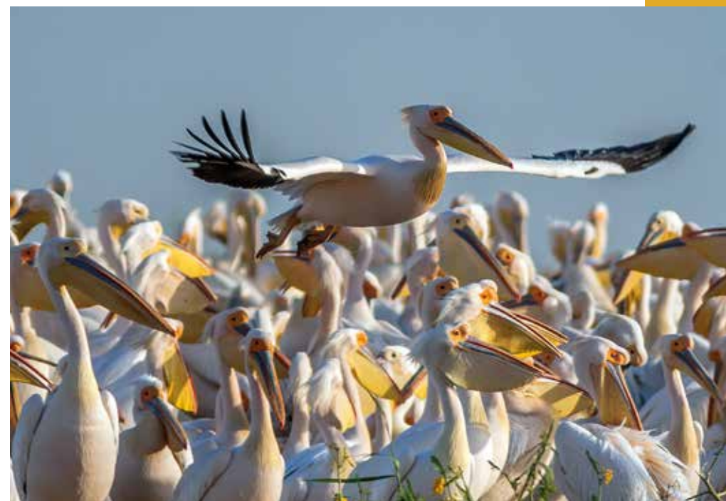
Great White Pelicans are threatened by habitat destruction and collisions with electric powerlines.

"AEWA combines a legal instrument and a community where states, NGOs and private sector cooperate to maintain a valuable shared resource." Szabolcs Nagy, Wetlands International