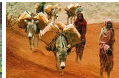
Some 135 million people may be displaced by 2045 as a result of desertification.