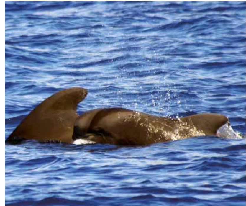
Pilot whales, mother and calf.