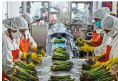
Brokering investment and technology agreements between developed, developing countries and economies in transition.

It does so by assisting in the identification, evaluation and negotiation of joint investment projects, and keeps a portfolio of investment opportunities.