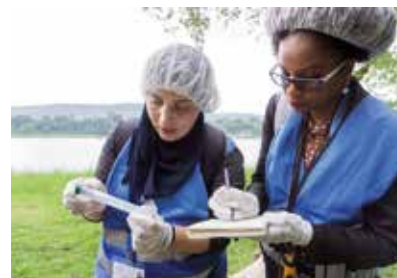
Hazard Simulation Exercise - simulating a flooding of the river Rhine in Bonn, May 2017. Two participants of the Intensive Summer Course „Advancing Disaster Risk Reduction to Enhance Sustainable Development in a Changing World“.