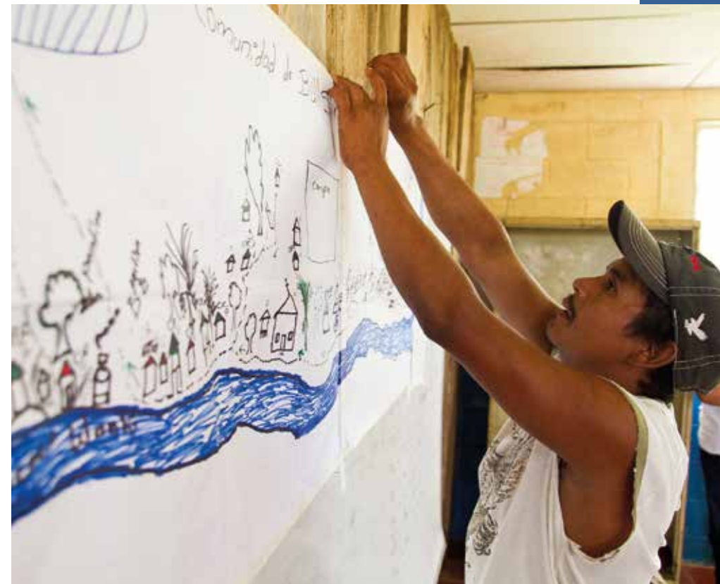
A community maps the risk of a local river overflowing. A simple but effective measure to reduce the risk of disasters.