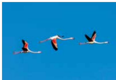
Greater Flamingos are highly gregarious and nest in very few colonies within the flyway.

AEWA projects depend on financial and in-kind contributions from individuals, states, organizations and the private sector. Please contact the Secretariat: awa.secretariat@unep-awa.org