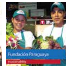
Fundacion Paraguaya, a UNEVOC Centre in Paraguay, not only educates rural and low-income youth but transforms them into entrepreneurs who can potentially lift themselves and their families out of poverty.