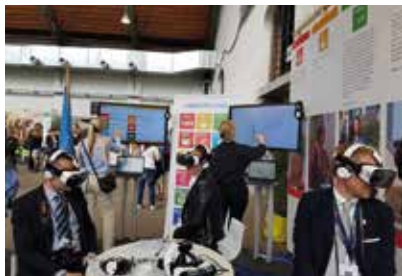
Interactive exhibitions bring people's voices to decision makers, show interactive data on people's perceptions of the SDGs and inspire participants to move from empathy to action through virtual reality experiences.

The Global Campaign Center in Bonn is a strategic hub to deliver the UN SDG Action Campaign's mandate to inspire people's action on the Sustainable Development Goals. The Global Campaign Center is central to the UN's strategy of providing real-time cutting-edge advocacy support, big data expertise and analytics to Member States and partners across the globe.