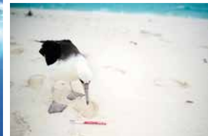
In 2016 the Marine Debris team removed hundreds of toothbrushes from the shorelines of Midway Atoll.