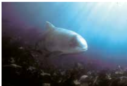
Harbour porpoise.

Current priorities include reducing bycatch and underwater noise, understanding the impacts of emerging issues such as tidal and wave energy as well as the cumulative effects on small cetaceans and of all the human pressures on the marine environment. In a collaborative manner, ASCOBANS works to develop and agree solutions and mitigation strategies. ASCOBANS supports the SDGs related to the protection of marine ecosystems, but also in terms of education and international collaboration of its Parties.