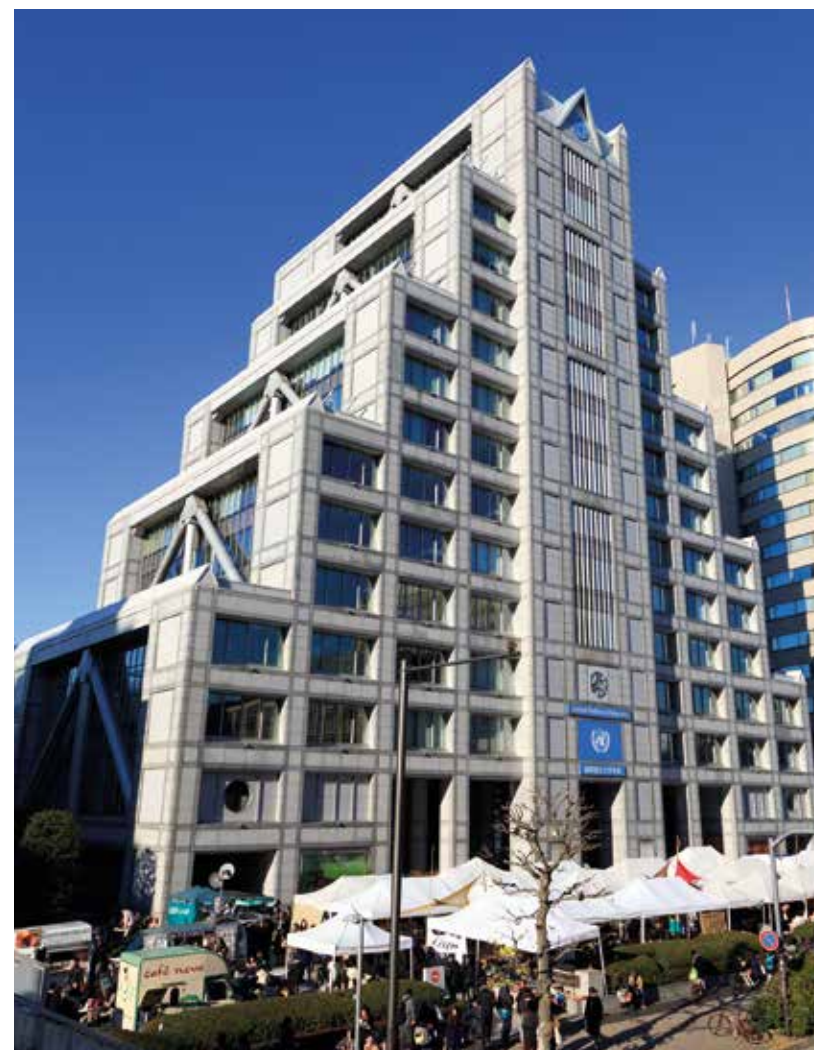
The headquarters of United Nations University is in Tokyo, Japan. Established in 1973, UNU is the academic and research arm of the United Nations.