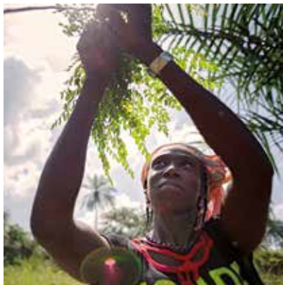
A community project to build resilience in Guinea cultivates Moringa to prevent soil Erosion.

Hans T. Sy, SM Prime Holdings, Inc. Philippines