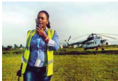
UN Volunteers support United Nations peacekeeping missions with expertise, playing key roles in coordination, logistics and movement control.

Join the volunteering community in support of the UN and sustainable development. To contribute to peace and development in your country, abroad or online: visit www.unv.org/become-volunteer . As a non-profit organization, you can get support from www.onlinevolunteering.org - more than 550,000 volunteers are ready to support you.