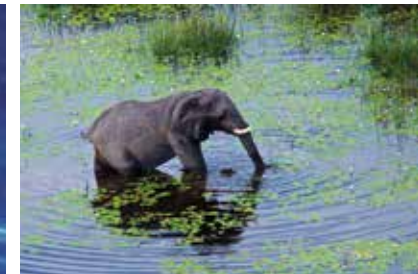
Elephant of the Okavango Delta