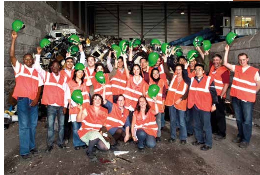
E-waste Academy for Scientists (EWAS) participants visiting a recycling plant.