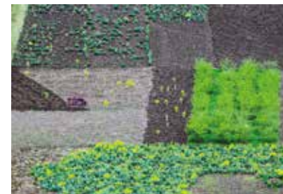
Humans obtain more than 99.7% of their food (calories) from land.