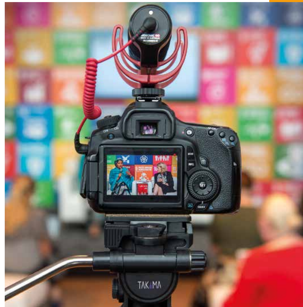
Panel Discussion on the SDGs.