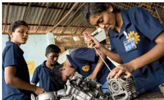
Youth empowerment and challenging gender stereotypes through skills development and TVET.

UNESCO-UNEVOC promotes knowledge sharing through its research and online communities, including the TVET Forum and UNEVOC Network Portal. Register on our portal and join the international debate.