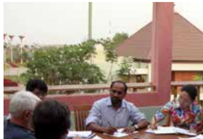
UN-SPIDER Technical Advisory Mission to Myanmar, March 2012.