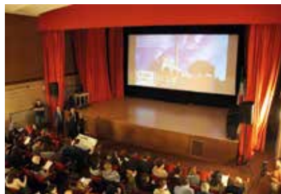
UNRIC's regular film screening Ciné-ONU.