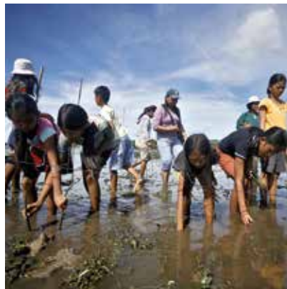
Children participate in a mangrove restoration project in the Philippines, helping to reduce the impact of tsunamis.