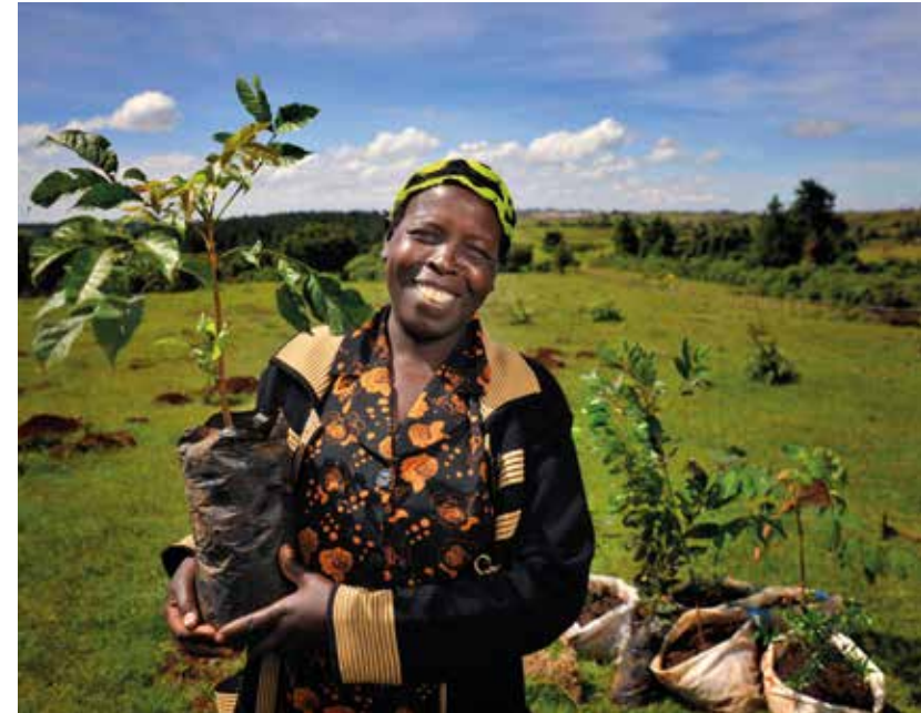
Restoring the soils of degraded ecosystems has the potential to store up to 3 billion tons of carbon annually.

"Old people who died 30 or 40 years ago would say that this is not their country if they were alive today. In the past, this country was very fertile and there were trees everywhere." Head of the Mani Hashem Hima Society, Jordan