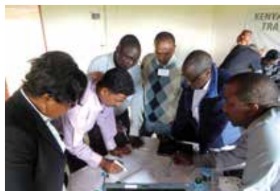
International cooperation to protect migratory waterbirds.

International cooperation across country borders is essential to ensure a favourable conservation status for migratory waterbird populations and to conserve their habitat, which consists mostly of wetlands. The legally binding AEWA Action Plan specifies core actions for contracting parties to warrant the conservation and sustainable use of migratory waterbirds. These include actions for species and habitat conservation as well as the management of human activities through various means including legal measures, sustainable use or undertaking emergency measures. Research and monitoring, education and awareness-raising, capacity-building and sustaining local livelihoods are other aspects addressed under the Agreement. By preserving waterbirds and their habitats, AEWA preserves the wider environment and its natural resources for people.