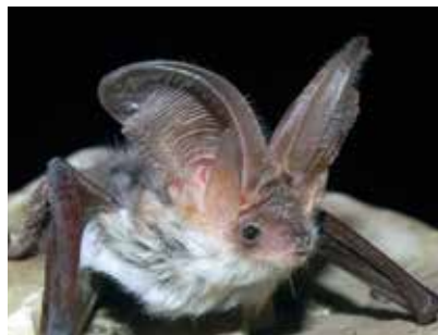
Bats are key predators of nocturnal insects and the need of their conservation was the reason for the establishment of the EUROBATS Agreement.

You can get involved in bat conservation, too! You don't need to be a scientist; you just need to be concerned about bats' problems. If you are interested to learn more about these fascinating flying mammals and to become an active bat conservationist, contact your local, regional or national bat conservation group.