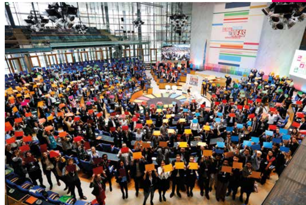
The annual Global Festival of Action for Sustainable Development brings together leading thinkers, policy-makers and civil society, together with gaming experts to explore trends, innovations and tools, and transform the way we think and act on Sustainable Development.