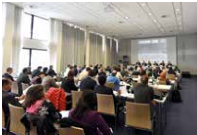
United Nations/Germany International Conference on Earth Observation, May 2015, UN Campus, Bonn.

Through its activities, UN-SPIDER contributes to reducing loss of lives and damage to property and supports the implementation of the 2030 Agenda for Sustainable Development.