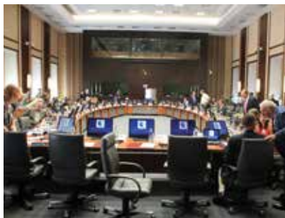
Fruitful conversations among delegates during a break at a Meeting of Parties to the EUROBATS Agreement.

The Agreement on the Conservation of the Populations of European Bats (EUROBATS) was set up in 1991 by range states after recognizing the unfavorable conservation status of bats in Europe, Northern Africa and the Middle East. It aims to protect all 53 species of bats identified in the Agreement area through legislation, education, conservation measures and international co-operation with Agreement members and with countries that have not yet joined.