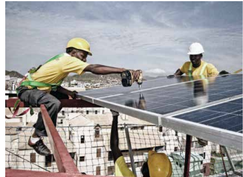
UNIDO ITPO Bonn opens up opportunities for investors and technology suppliers to find potential partners.